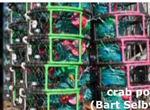
crab pots (Bart Selby)