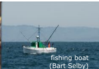
fishing boat (Bart Selby)