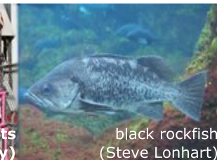
black rockfish (Steve Lonhart)