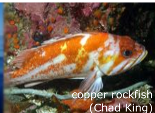
copper rockfish (Chad King)