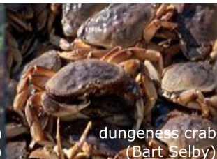
dungeness crab (Bart Selby)