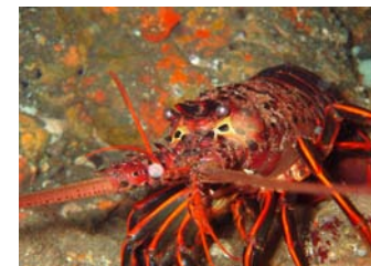
California spiny lobster