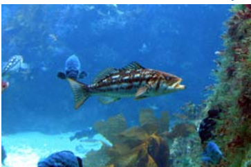
kelp bass (Steve Lonhart)

Photo credit: top left (Tressa Bronner); top right (NOAA/NOS); middle center (Bart Selby)