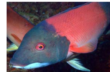
California sheephead (Ed Bierman)