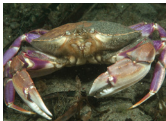
dungeness crab (Ken Bondy)