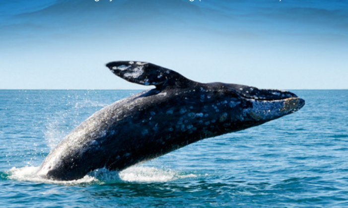
Image above: Bodega Head below: gray whale breaching

Offer recreational and economic opportunities