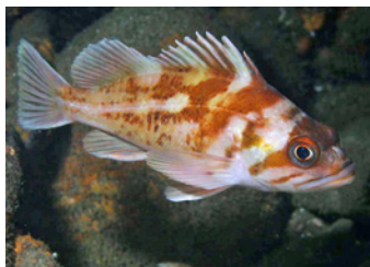
copper rockfish (Steve Lonhart)