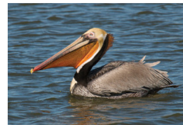
brown pelican