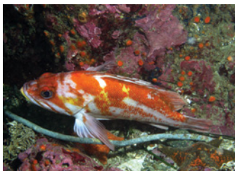
copper rockfish (Chad King)