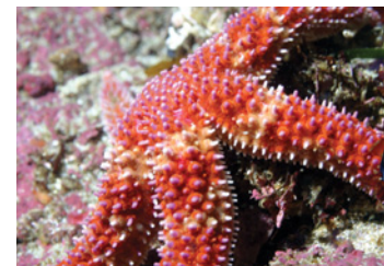
rainbow sea star (Chad King)