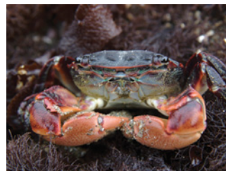
striped shore crab (Jerry Kirkhart)