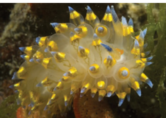
nudibranch (Ken Bondy)

Secluded sandy beaches and offshore reefs provide safety for harbor seals and southern sea otters. These marine mammals pup and haul out on the near-shore rocky reefs. The kelp beds create underwater forests that are home to kelp crabs, colorful nudibranchs, and many species of rockfish. From the Point Buchon headland whale watchers may see gray whales migrating along the coast, or even a breaching humpback.