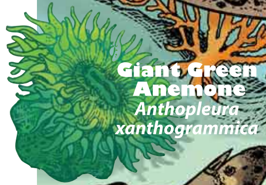
Giant Green Anemone Anthopleura xanthogrammica