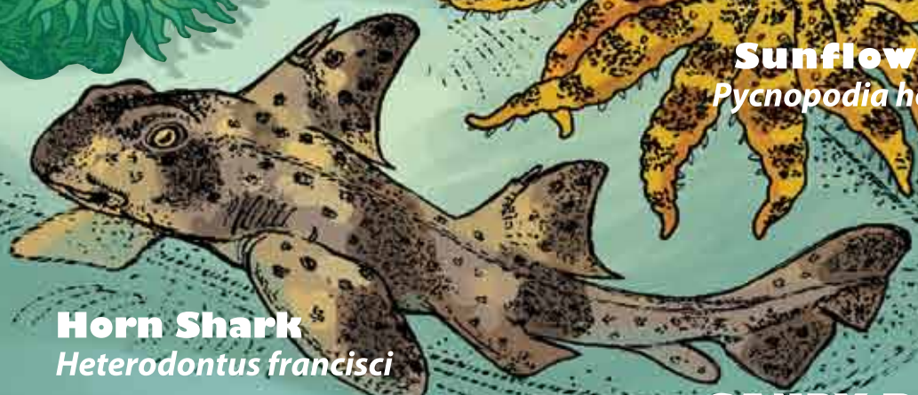
Horn Shark Heterodontus francisci